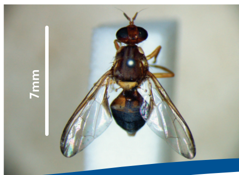
Adult fruit fly